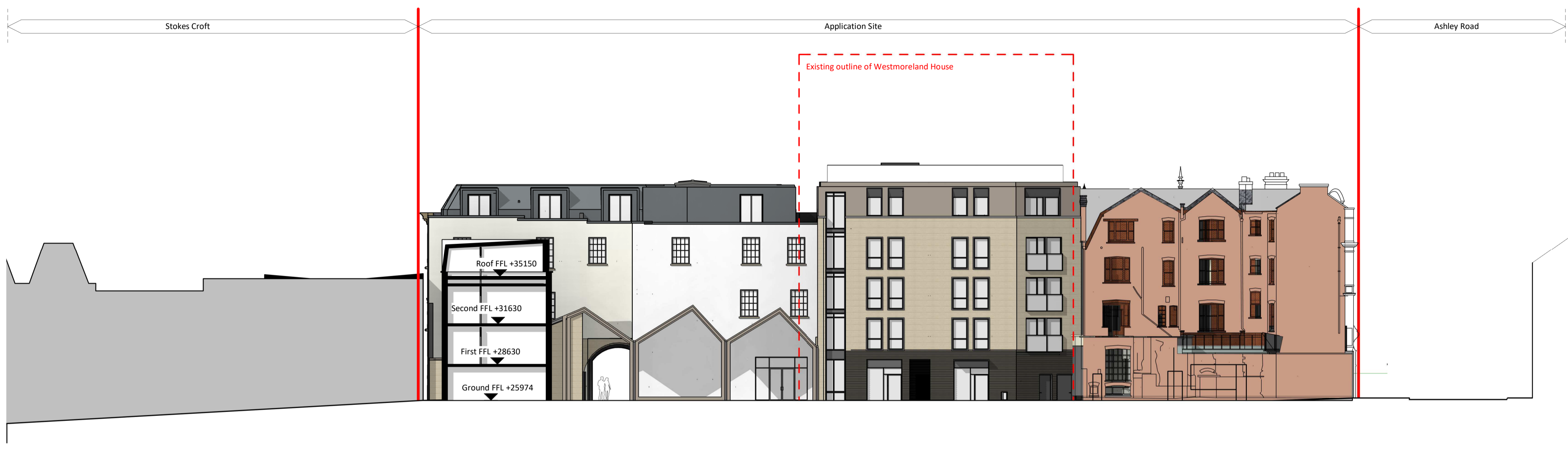
1 Sectional Elevation GG 1:200