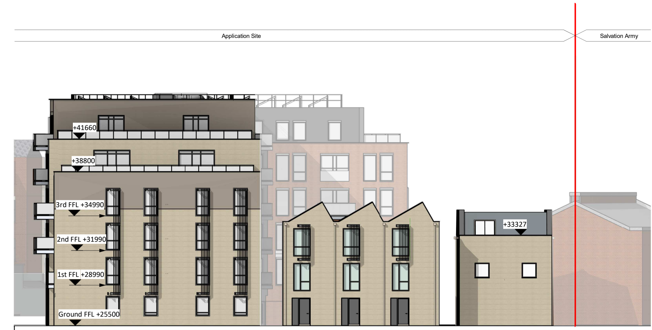
Sectional Elevation LL 1:200