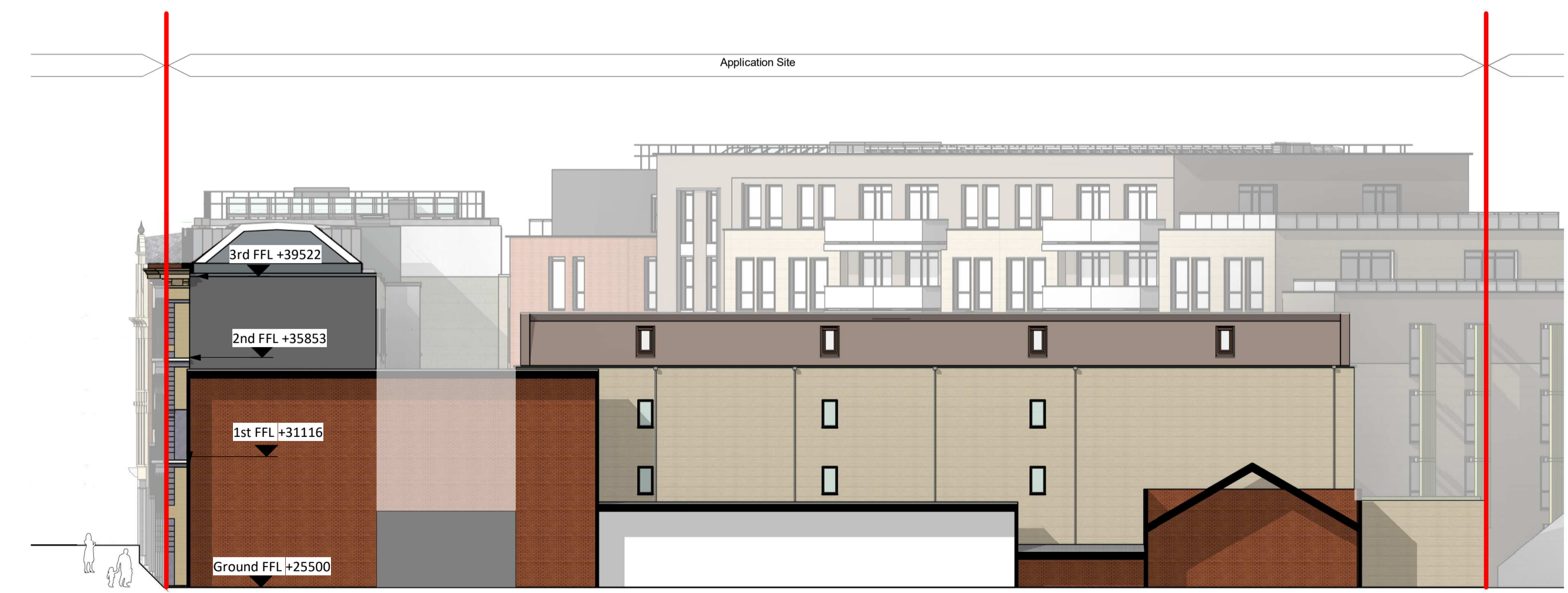
Sectional Elevation MM 1:200